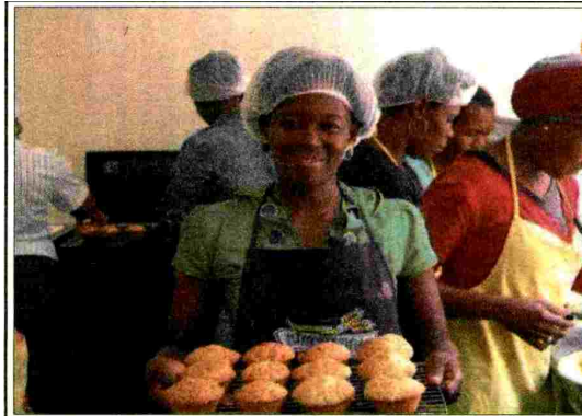
BAKE FOR PROFIT: Students in action at the GetOn Centre.

Training programmes include: Basic Computer Skills, Office Ad-